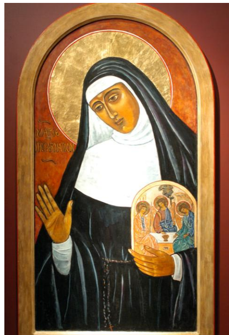
Saint Marie of the Incarnation